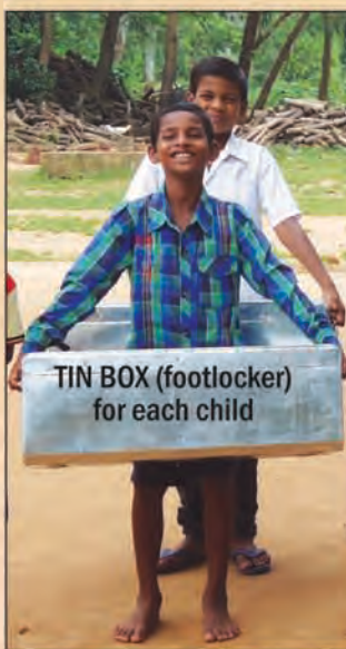
TIN BOX (footlocker) for each child