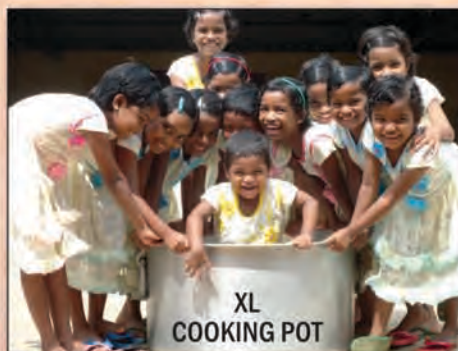
XL COOKING POT